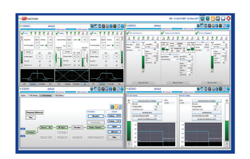
Control GUI (4 Receivers)