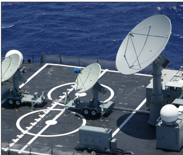
Here is a ship-stabilized, 7.3 meter Model 6000 System.

With larger systems, we can provide more exotic feed configurations. The system above autotracks in L- and S-Band, but receives signals in UHF, VHF, L-Band, S-Band, and C-Band. This system also has up-link capability.