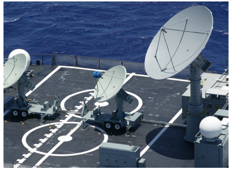
Here is a ship-stabilized, 7.3 meter Model 6000 System.

With larger systems, we can provide more exotic feed configurations. The system above autotracks in L- and S-Band, but receives signals in UHF, VHF, L-Band, S-Band, and C-Band. This system also has up-link capability.