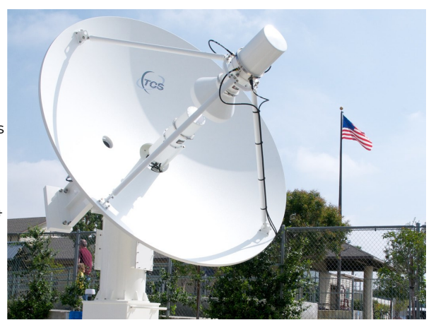
Our Model 3000-8 System with L-,S-, and C-Band Autotracking Capability on a Trailei

This full-sky antenna system supports from an 8-foot (2.44 meter) to a 12-foot (3.66 meter) reflector. The 8-foot reflector is offered in both a single piece and multisection configuration. The Model 3000 System moves from -5° to 185° in Elevation and is offered in both continuous and cable-wrap configurations in the Azimuth Axis.